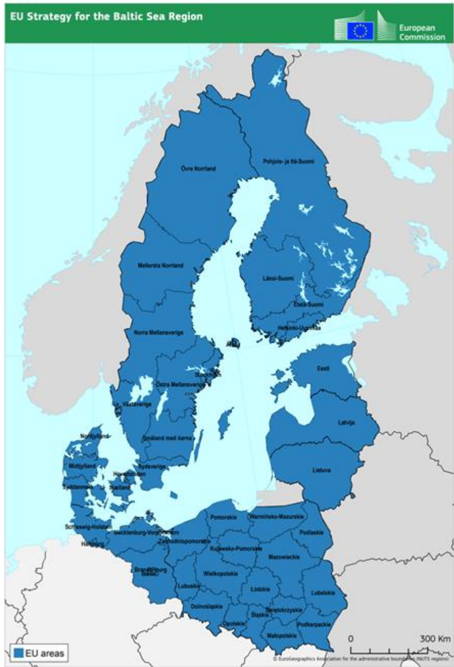
Annex 1: map of the EU Strategy for the Baltic Sea Region