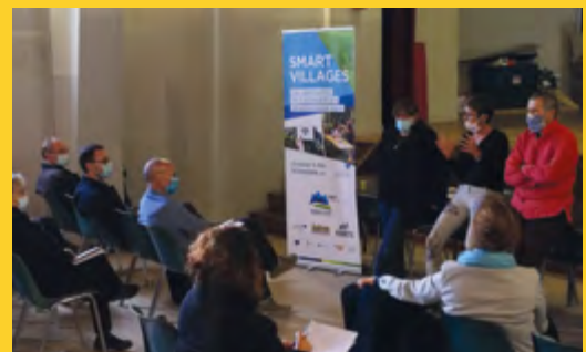
La Chapelle en Vercors, 2020

The SmartVillages project has been dealing with the questions of digital transformation in rural areas since April 2018. Two events took place during the French EUSALP Presidency to bring together politicians, project managers, researchers, associations involved to consider the development of Smart Villages initiatives as a key opportunity for the development of a sustainable and attractive Alpine Region.