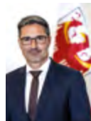
Arno Kompatscher, President of the Autonomous Province of Bolzano- Bozen