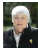
Jacqueline Gourault, Minister of Territorial Cohesion and Relations with Territorial Communities